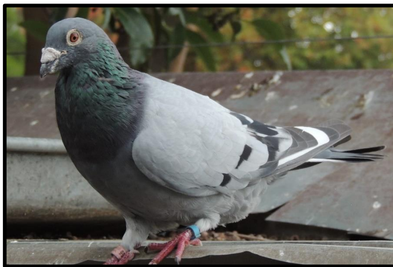
2018 young birds bred off my best VANDENABEELE HOUBEN birds

Lot 6 – SIRE 06-32756 bred from 13425, grandson of WITTENBUIK and 11019. SIRE of the 2018 young birds below